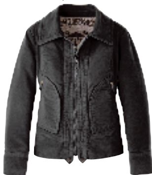
"CLIMATA-F" JACKET, $200, DIESEL, 214-363-5642

Herrera, Custo Barcelona, and Diesel. For more info, go to northparkcenter.com. Tickets from $25 (all reserved seats).