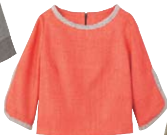
TUNIC BLOUSE, $286