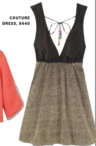
COUTURE DRESS, $440