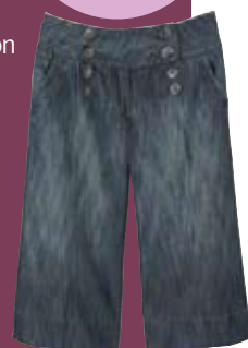
LEVEL 99 CAPRIS REGULAR PRICE $98 LOCAL BREAKS PRICE $78.40

Visit Luckymag.com for weekly updates on Dallas' best sales!