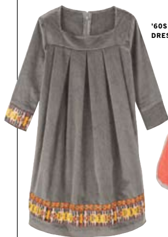
'60S CORDUROY DRESS, $429